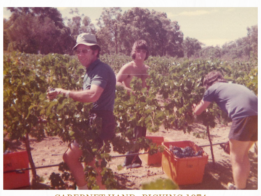
CABERNET HAND-PICKING 1974

"Personally, maybe it's because I'm European, I like to know the wine is in contact with a natural product, that is sustainable, recyclable, it feels more in tune with what I want the wine to be."