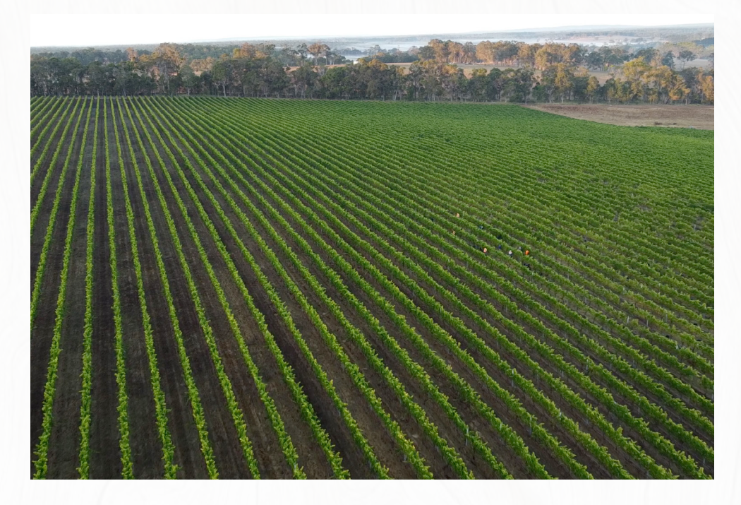
CHARDONNAY HAND-PICKING 2021