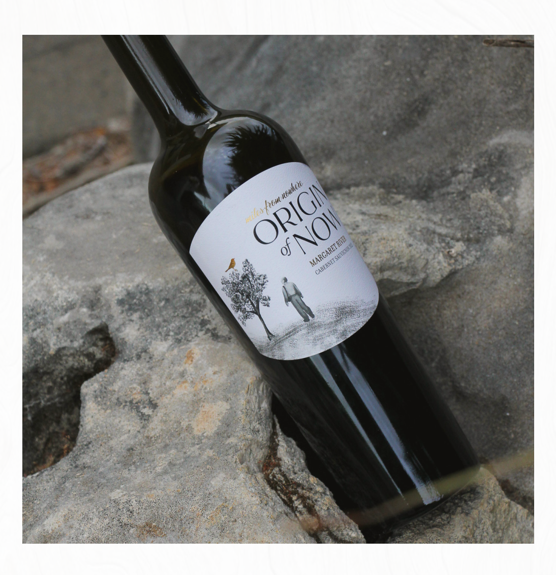
"When we make these wines, there is no compromise."